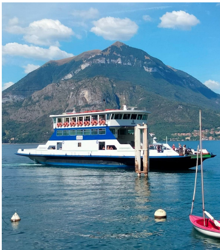
Lago di Como – near Varenna & Menaggio